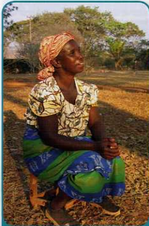
Kalene lady taking a break

before reaching the nearest tarmac. The greatest problem has been recruiting and retaining trained Zambian staff. Both nurses and doctors, after receiving training within Zambia, are understandably attracted by the more lucrative jobs overseas, many of them working in the UK. The ravages of AIDS have also cut short the lives of many health professionals. Consequently, Kalene has relied on a diminishing staff of missionary nurses and locally trained nurses.