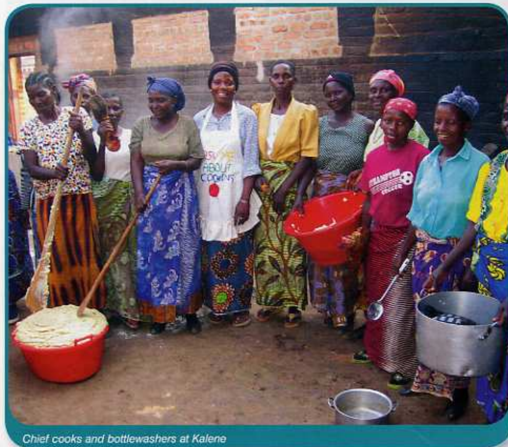
Chief cooks and bottlewashers at Kalene

There are several reasons for this. Kalene has been isolated both geographically and by the effects of civil wars in adjacent Angola and the Democratic Republic of Congo. Communications are still poor, with 60 miles of dirt road